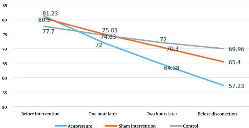
Figure 3. Trend of changes in the mean stress score over time in the acupressure, sham intervention, and control groups

significantly lower mean stress scores compared to the sham intervention and control groups (Table 2).