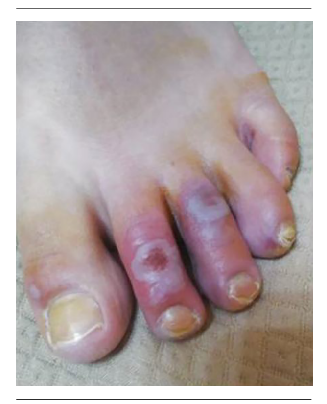
Figure 4. Skin ulcers

Table 1. Symptoms and Personal History of the Patients