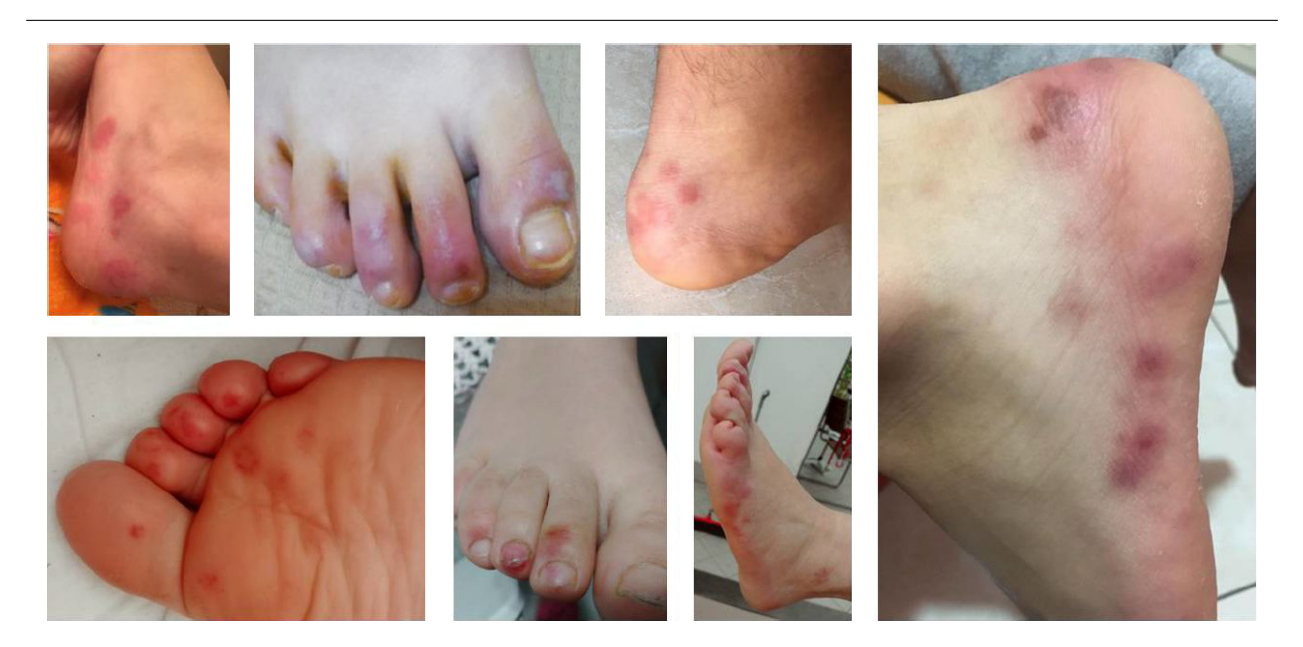
Figure 3. Red to purple macules, plaques, and nodules, also with erythema multiform-like