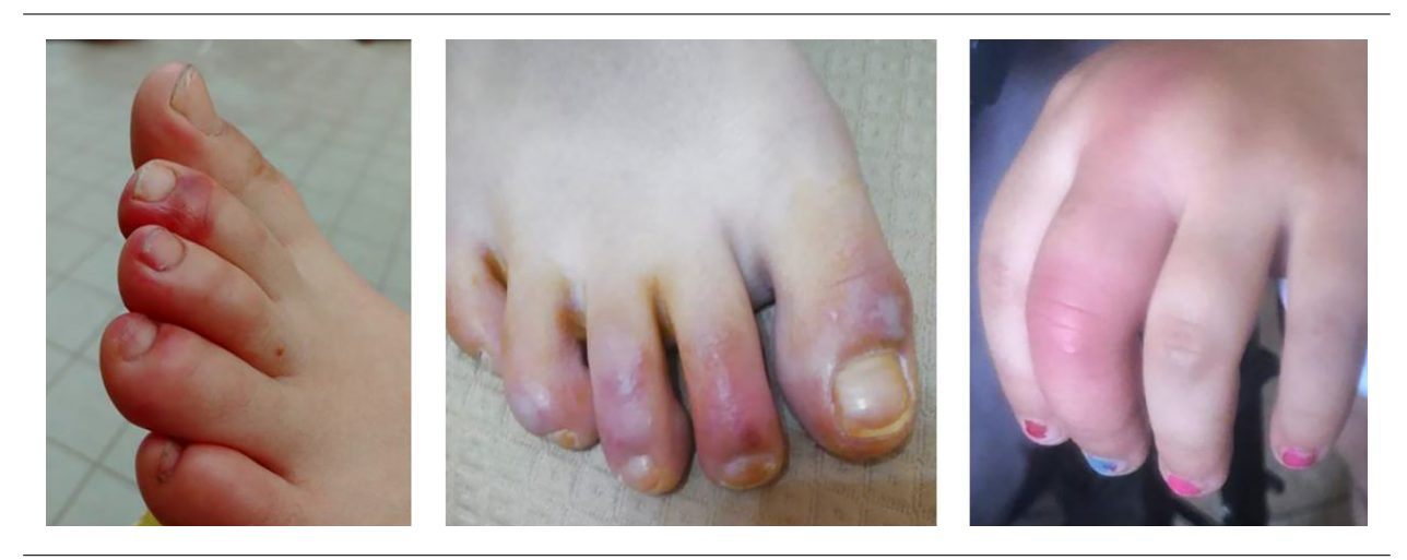
Figure 2. Chilblain-like pattern

Figure 1. Values of NRS (gray) and DN4 (black) for each of the 11 patients