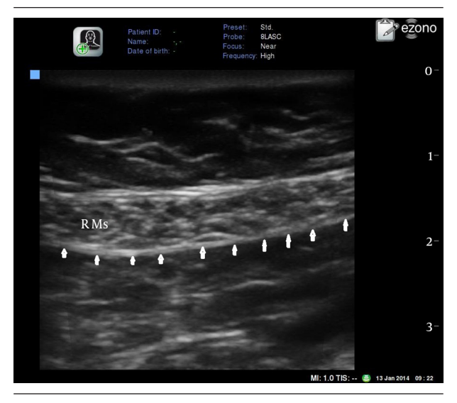
R Ms: rectus abdominis muscle. Arrows: posterior rectus sheath.

Figure 1. Transverse Ultrasound View of the Rectus Muscle Just Above the Umbilicus