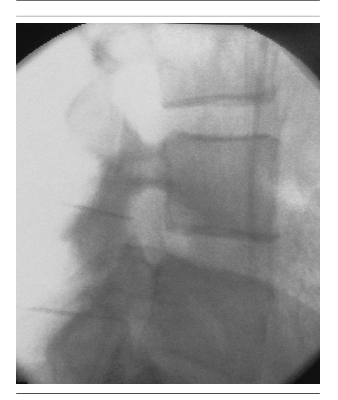
Figure 2. Lateral Fluoroscopic View Showing the PRF Cannula Adjacent to the Facet joint and Under the Articular Capsule

We chose the tip of the SAP as a landmark because the SAP is readily visible on fluoroscopy and at this point, the capsule is abundant and loose, forming a pouch that balloons upward toward the base of the next transverse process (9), allowing easier access to the subcapsular space.