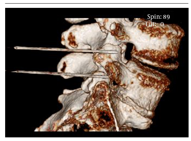
Figure 3. Three-Dimensional Computed Tomography Reconstruction Image of the Facet joints With PRF Cannula Adjacent to the Facet joint

Due to the complex, multisegmental innervation of the facet joints, selective diagnostic medial branch blocks are needed to confirm the clinical diagnosis. The subcapsular infiltration of a local anesthetic with contrast medium should be performed with caution, as local anesthetics can be chondrotoxic (10).