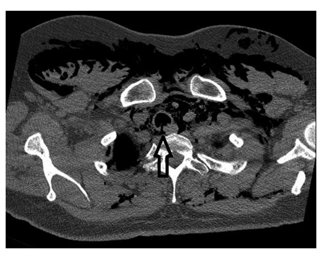
Figure 2. Chest CT Showing Linear Tracheal Rupture in Posterior Wall (Arrow), Pneumomediastinum, and Subcutaneous Emphysema

Iatrogenic tracheal injury following intubation is extremely rare. For intubation with a patient was disendotracheal tube, the incidence ranges between 1:20,000 and 1:75,000, and the lesions are typically longitudinal lacerations of the posterior tracheal wall (pars membranosa) (1, 2). Tracheal injury occurs mainly in women, as their airways have a narrower diameter, their tracheas are shorter,