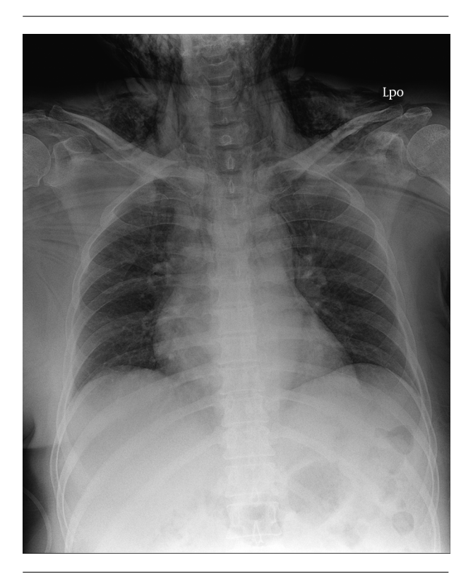
Figure 1. Chest X-ray PA View Showing Pneumomediastinum and Subcutaneous Emphysema in the Neck and Chest Wall

under bronchoscopy. Low-tidal-volume lung ventilation was applied to allow the lesion to recover without deteriorating the pneumomediastinum. A pressure-controlled mode was applied as follows: tidal volume of 250 - 350 ml/kg, frequency of 20 - 25/min, and pressure-limited ventilation (mean airway pressure < 25 cm \rm H_2O ) with permissive hypercapnia. A course of broad-spectrum intravenous antibiotics was administered. The patient improved, and three days later, chest CT showed markedly reduced mediastinal and subcutaneous emphysema. After eight days, bronchoscopy showed that the lesion was healing. Endotracheal tube extubation was performed 13 days after the initial injury, and the patient was discharged in good condition 5 days later.