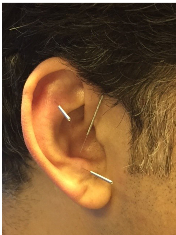
Figure 1. Ear points associated with pain relief used for acupuncture in intervention group

they were considered as nonrespondent and were given rescue medicine. For those patients who did not have proper relief in pain 10 minutes after treatment, dexamethasone injection was done as a rescue medicine. The rescue medicine was chosen and prescribed by the neurologist advisor of the project.