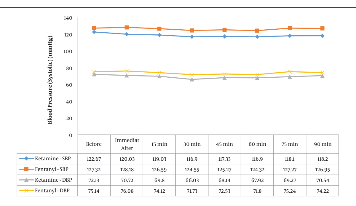
Figure 1. Comparison of mean systolic and diastolic blood pressure at different times in the two groups is shown.