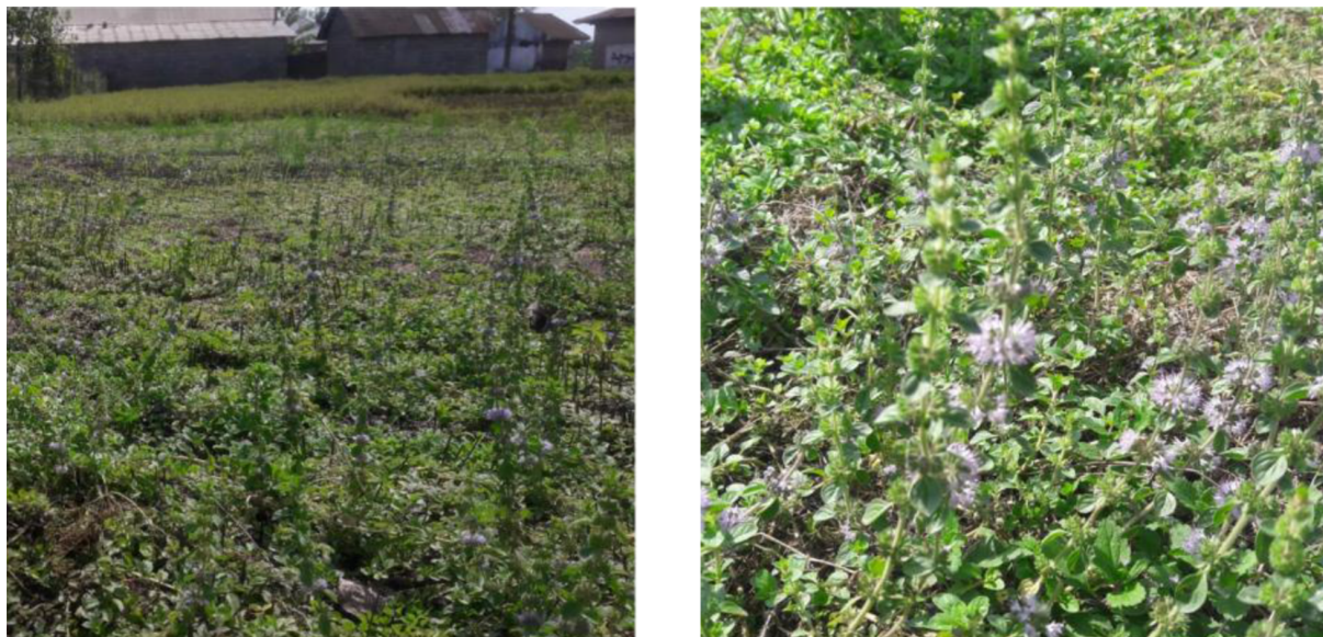
Figure 3. Two photos of Ziziphora ( Ziziphora persica ) planting areas in Lahijan, northern Iran

The chemical materials used for digestion included HNO 3 (nitric acid) (65%), ClH 3 O (hydrochloric acid) (37%), H 2 O 2 (hydrogen peroxide) (30%), and KCl (potassium chloride). We also applied distilled deionized water for sample dilution. The solutions applied for FAAS calibration were the Merck standard solutions of the studied elements. Next, we used a Berghoff MWS-2 microwave digestion system to digest dried plant samples in an acidic solution. The dried samples of around 200 mg were used in the digestion vessels containing 8 mL HNO 3 and 10 mL H 2 O 2 . Digestion lasted around 30 min and the vessels were cooled at room temperature. Then, each solution volume was made up to 50 mL for each sample using deionized water. Analysis was done on all samples using the FAAS method to detect Pb, Cd, Cu, Zn, and Hg (23-26).