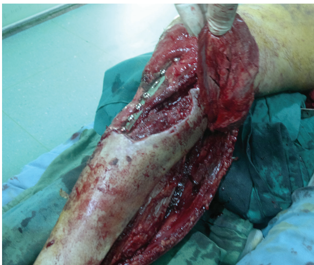
Figure 2. Right medial head of gastrocnemius is freed and ready to transfer to the donor area.