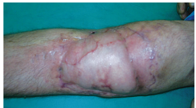
Figure 5. Final result of the repaired leg by the muscle flap.