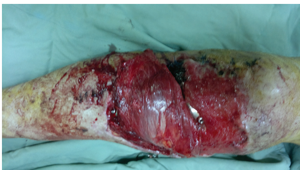
Figure 3. The medial head of the gastrocnemius is passed through fasciocutaneous tunnel and inset to the donor area.