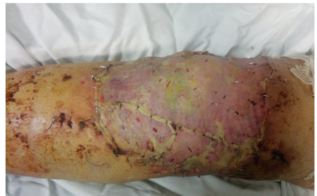
Figure 4. The gastrocnemius muscle flap after removing of the tie over, five days after the operation.

The tissue defect has always been a challenge for reconstructive surgeons. The first systemic procedure using flap for repairing a mutilated nose in an adult is attributed to Sushruta, who lived in the sixth or seventh century BC. (9) In 1892 the Italian surgeon Ignio Tansini, the professor of surgery at the University of Pavia, perfected the method of breast amputation for breast cancer by radical removal of the tumor with the overlying skin. (10) On an early attempt, Tansini covered the resulting defect by a dorsal flap whose pedicle was based in the arm pit. But the flap did not survive completely. Tansini,