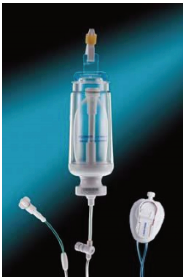
Figure 2. Fornia Pump.

75.9 ± 9.8 kg and for the conventional group they were 44.8 ± 11.15 years old and 72.2 ± 8.1 kg. There were no significant differences regarding demographics and underlying diseases, including hyperlipidemia, diabetes, cardiovascular and renal diseases, between the two groups (Table 1). Pain levels of patients in each group are summarized based on facial pain scale in Table 2 and numerical rating scale in Table 3.