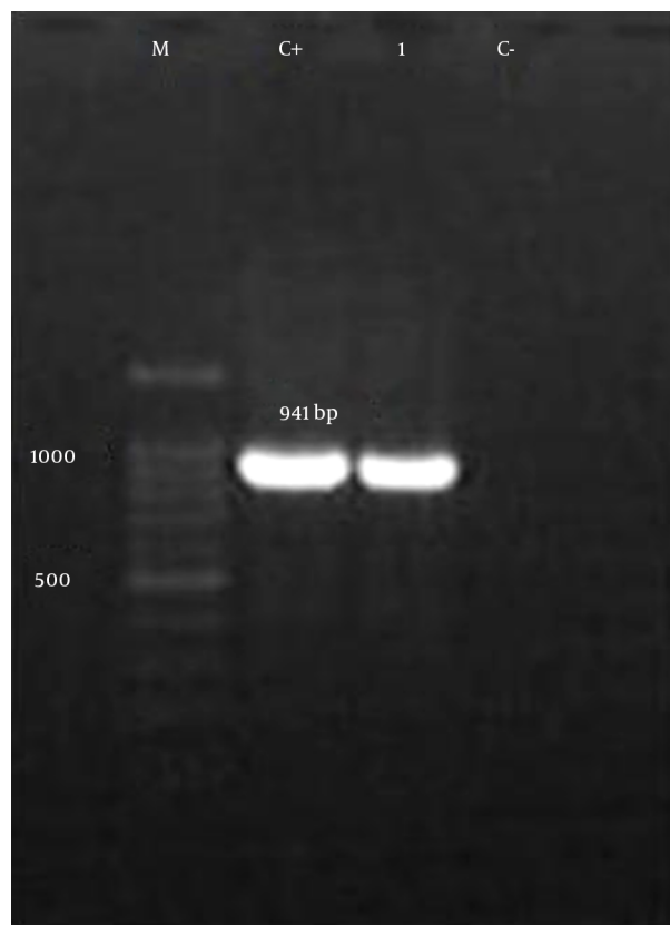
M, marker 100 bp; C+, standard E. faecalis strain 29212 as a positive control; 1, testing strain; C-, negative control.

ble 2. In general, the antibiotic resistance of strains isolated from urine was evaluated for tetracycline (65 strains [90.3%] resistant), minocycline (64 [88.9%]), gentamicin (120 \mu g) (21 [29.2%]), ciprofloxacin (17 [23.6%]), levofloxacin (12 [16.7%]), and gatifloxacin (11 [15.3%]). The same evaluation was conducted for the strains isolated from feces for tetracycline (48 [76.1%]), minocycline (45 [71.4%]), gentamicin (10 [15.8%]), ciprofloxacin (8 [12.6%]) and gatifloxacin (4 [6.3%]). In the present study we did not detect any resistance to vancomycin, ampicillin, penicillin, nitrofurantoin, or linezolid in isolates from urine or fecal specimens. All studied isolates in both samples were susceptible to daptomycin with a minimum inhibitory concentration (MIC) value of \leq 4 \mu g/mL. The number of strains with the MDR phenotype isolated from the 72 urine specimens was 9 (12.5%) and for the 63 fecal specimens was 7 (11.1%), as shown in Table 3.