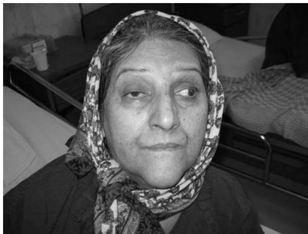
Figure 1. The patient several days after surgery

Brain MRI showed a pituitary mass measuring about 4 cm. Differential diagnosis considered in this stage were pituitary adenoma, granulomatous diseases (tuberculosis, fungal infection, etc.) or vascular aneurysm.