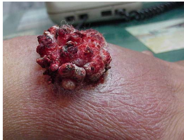
Figure 1. Cauliflower-like lesion on the hand

Now, what is your diagnosis? (The answer is on page 159)