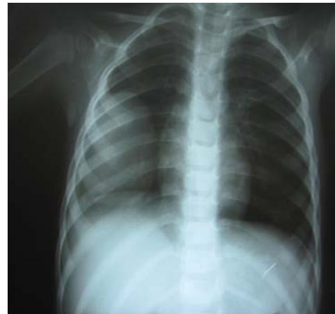
Figure 1. Chest x-ray of the patient.

Now, what is your diagnosis? (The answer is on page 241)