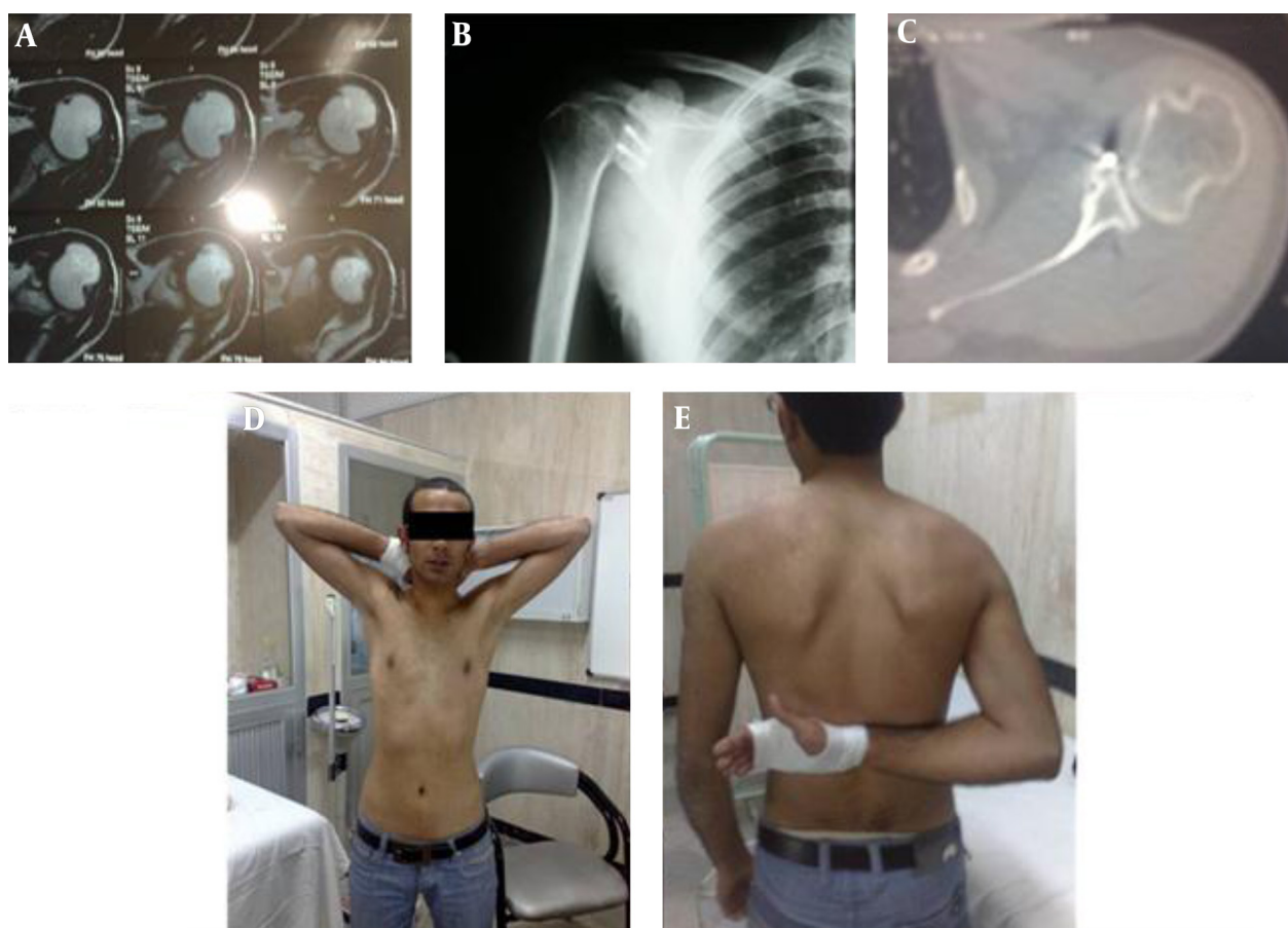
A) Bony Bankart lesion and a Hill Sachs lesion on humeral head; B) Post-Operative X-ray; C) Follow-up CT scan shows solid union of the coracoid graft; D) Normal external and internal rotation ranges of motion of the shoulder one year after surgery compared to unaffected side; E) Internal rotation range of motion of the shoulder one year after surgery

ligament were detached and the bone was used as a bony block in the anterior inferior glenoid region between su-