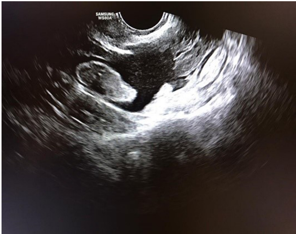
Figure 5. Ultrasound results showing free fluid with internal echo in the pelvic cavity, compatible with hemoperitonea