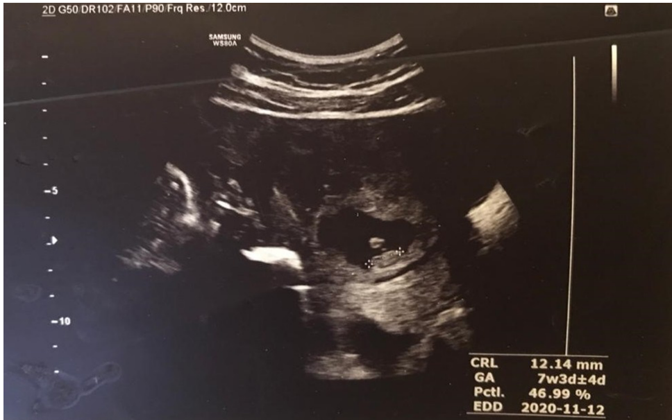
Figure 1. Ultrasound results showing a live embryo with the crown lump length of 12 mm and an estimated gestational age of seven weeks ± three or four days