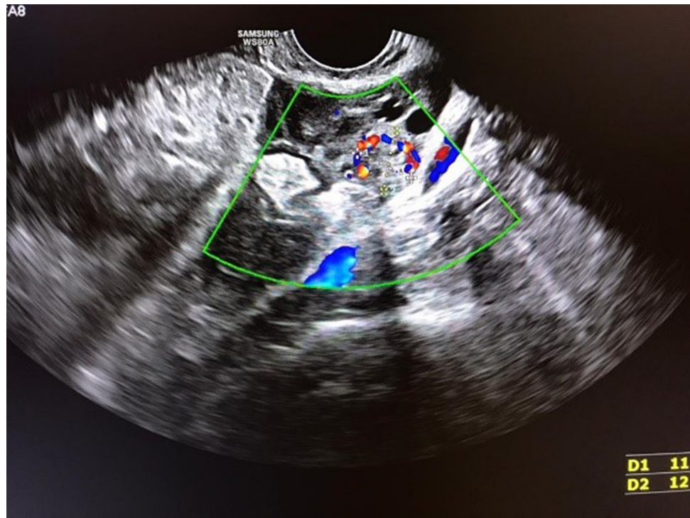
Figure 3. Color doppler ultrasound demonstrating the ring of fire sign