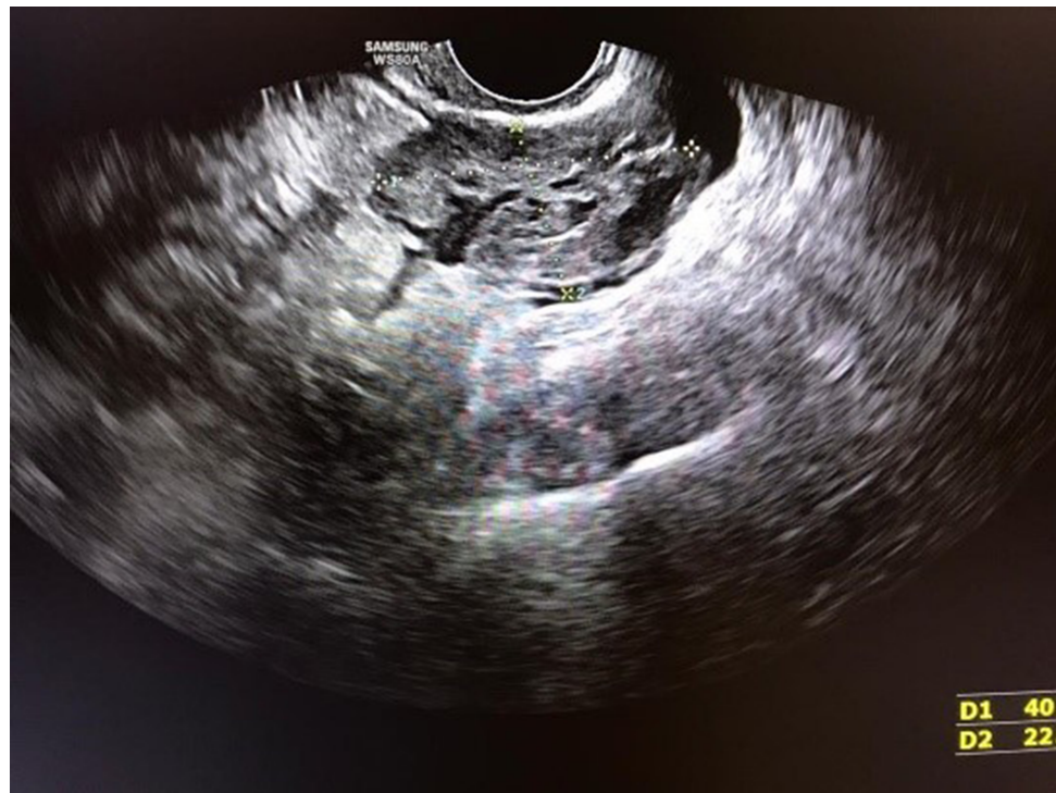
Figure 4. Ultrasound findings showing a 40 × 22 mm isoechoic irregular-shaped lesion in the left adnexa mimicking a clot