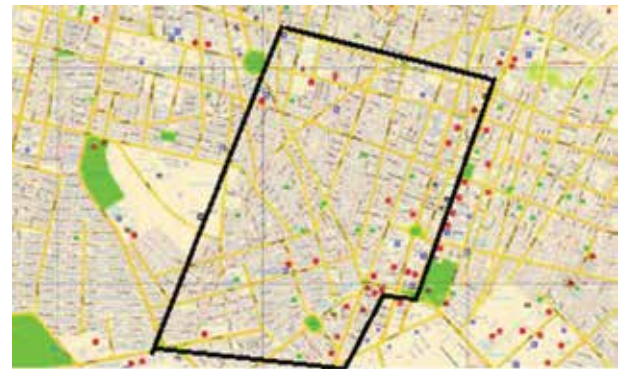
Figure 1. Most Crowded Streets With the Highest Level of Traffic in Zahedan

When seeking to measure noise levels, the highest traffic load on the main streets was found to occur between the hours of 07:00 and 22:00. Next, 31 test locations were selected from the streets with the highest levels of traffic (Figure 1). Noise was measured using a CEL-440 Classic sound level meter with analyzer, after calibrating the device with a 1 KHz Cel calibrator at 114 dB and situating the meter at a height of 150 cm above the ground. Equivalent noise (Leq) was measured in 5-minute segments, measuring maximum (Lmax), minimum (Lmin), peak (Lpk), and L90 levels at 1-hour intervals. The tests were performed for 3 consecutive weeks between the hours of 07:00 to 22:00, in all 31 test locations in the October-November area of the city, in weighted networks of A and fast mode.