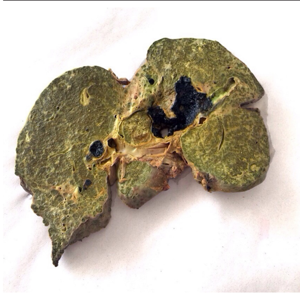
Figure 1. A Section From an Explanted Liver With Primary Sclerosing Cholangitis