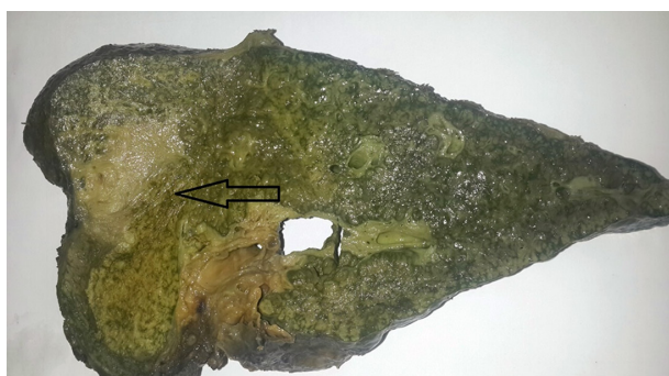
Figure 3. A Section From an Explanted Liver With Primary Sclerosing Cholangitis and Cholangiocarcinoma (arrow) Diagnosed Before Liver Transplantation