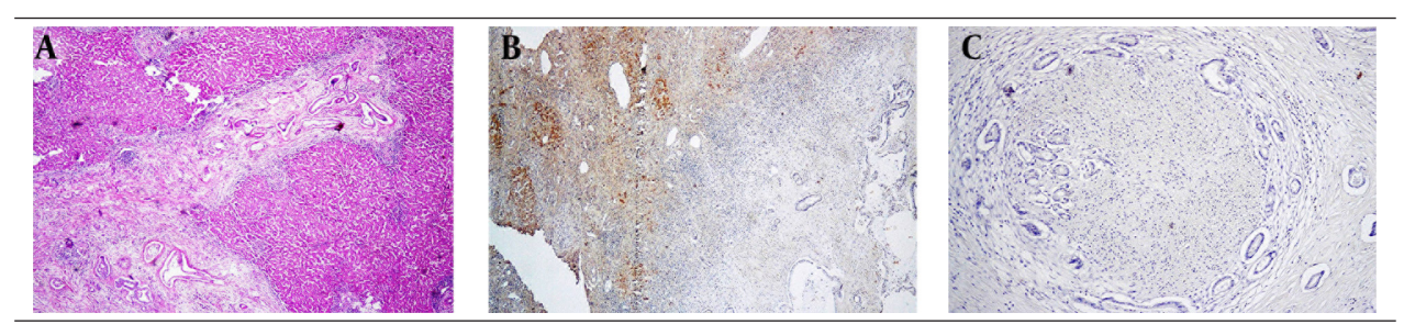
Figure 3. A, Sections From Cholangiocarcinoma (H & Ex100); B, Arginase Staining Shows Negative Cytoplasm (Note the Intense Staining of the Normal Liver (Vertical Arrow) in the Vicinity of Negative Glands (Horizontal Arrow); C, Glypican Shows Negative Cytoplasm