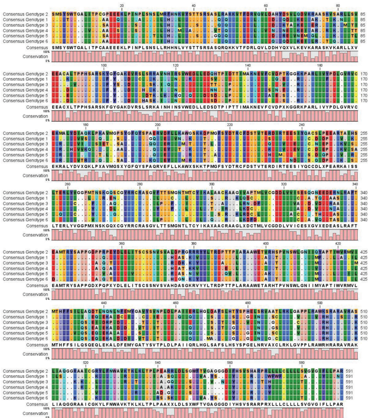
Figure 1. Multiple Sequence Alignment of Consensus Sequences of the Genotypes 1 to 6 of the HCV NS5B Protein Are Shown

acid long beta hairpin loop is present in the HCV NS5B protein which protrudes from the enzyme active site. This loop interferes with binding to the double stranded RNA due to steric hindrance (11, 12). The consensus sequence analysis shows that this loop is highly variable among all the HCV genotypes. It is reported that E18, Y191, C274, Y276 and H502 are important for interaction of template/primer (11). Consensus sequence analysis shows that these residues are highly conserved among