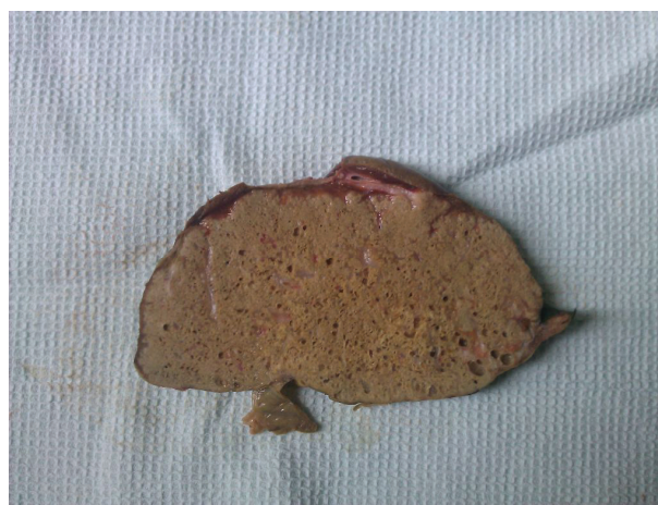
Figure 2. Gross View of the Resected Liver Mass With Tiny Sponge Like Cysts.

Physical examination showed icteric sclera. Heart and lung examination were unremarkable. Abdominal examination showed hepatomegaly. Laboratory findings showed; anemia, hyperbilirubinemia and high AST and ALT levels (Table 1). Abdominal CT scan showed multiple, different sized and shaped masses, mostly in the right lobe, with the largest one measuring 10x10 cm (Figure