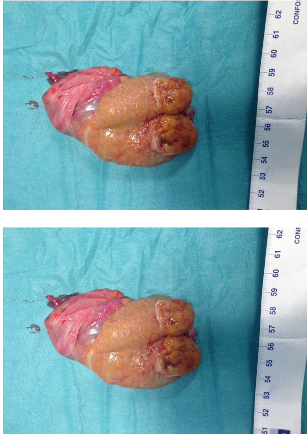
Figure 1. Right Radical Orchidectomy

ng/ml, 2.2 mIU/ml, 0.8 mU/mL, and 3.6 mg/mL, respectively (normal range: 2.10 - 7,50 ng/mL, 1.5-12.4 mIU/mL, 1,8 - 12,0 mIU/mL, and 2 - 18 ng/mL, respectively).