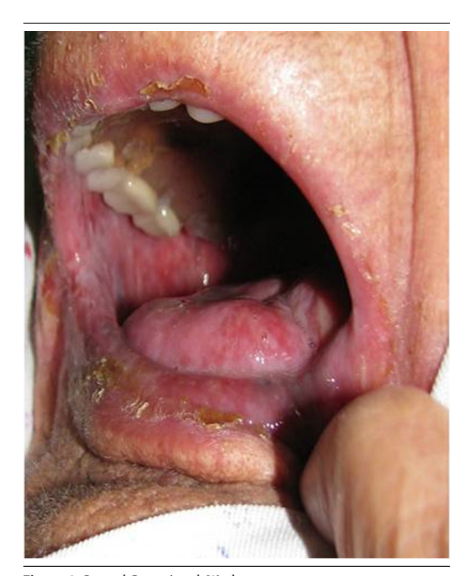
Figure 6. Control Group in 4th Week