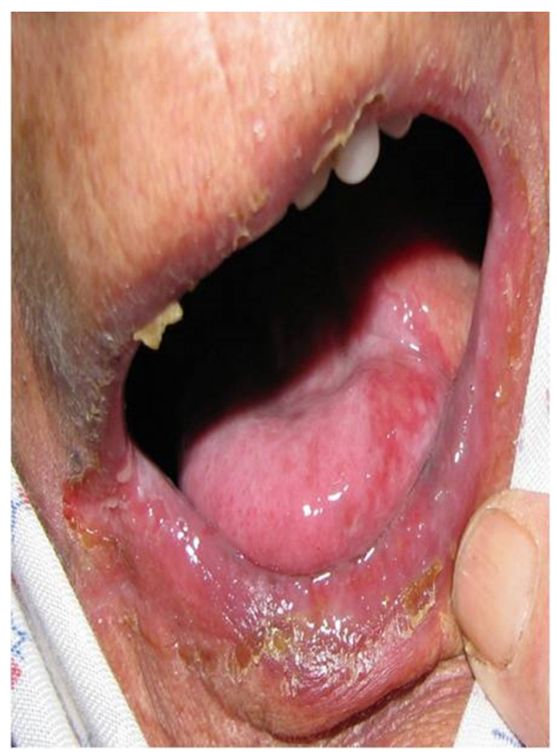
Figure 4. Control Group in Second Week