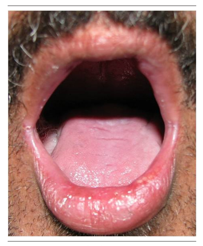
Figure 3. Case Group in Second Week