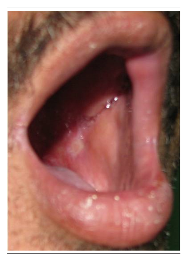
Figure 5. Case Group in 4th Week