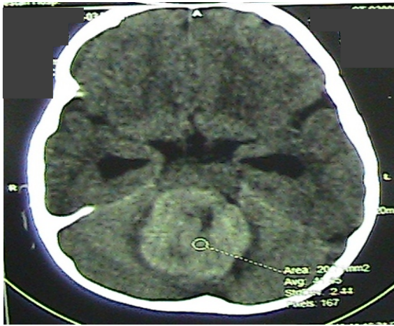
Figure 1. This figure shows brain CT scan at the time of diagnosis.

tumor. Also cytological examination of cerebrospinal fluid was normal. After surgery we began chemotherapy with a combination of Cisplatin, Ara-c, Vincristine, Hydroxyurea, Lamustin, Procarbazine, Cyclophosphamide and Methyl prednisolon (8 at 1 protocol) every four weeks for 12 courses. Follow up examination revealed a profound delay in mental development but brain MRI performed 12 months after surgery revealed no evidence of tumor recurrence. The patient is presently 3.5 years old and his chemotherapy is finished and he is stable with no sign of relapse.