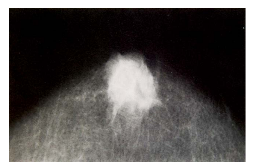
Figure 1. Right breast craniocaudal view. Mammography of the right breast shows a central mass with no micro calcifications.