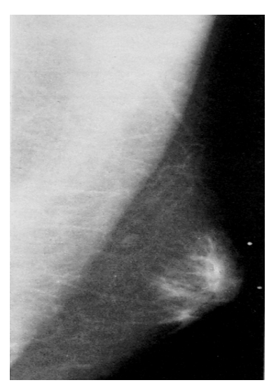
Figure 2. Left breast lateral – oblique view. Mammography of the left breast revealed an ill – defined density with no specific mammographic appearance in the subareolar region.

nipple. Examination of the left breast showed a bloody discharge from a single duct. Nipple areola complex was normal in the left breast and there were no skin changes or nipple retraction. The axillary lymph nodes were not palpable.