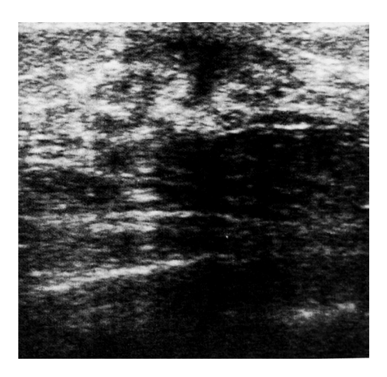
Figure 3. Breast ultrasonography showed a hypo – echoic lesion with non homogeneous echogenecity in the central region