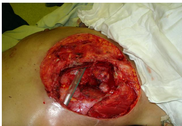
Figure 4. Wide excision of ulcer and chest wall