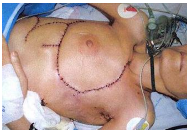
Figure 5. Patient's appearance after extubation

its efficacy on pain management and duration of analgesia [1-9].