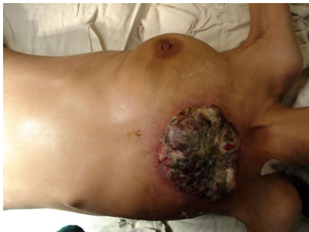
Figure 1. Pre operation ulcer