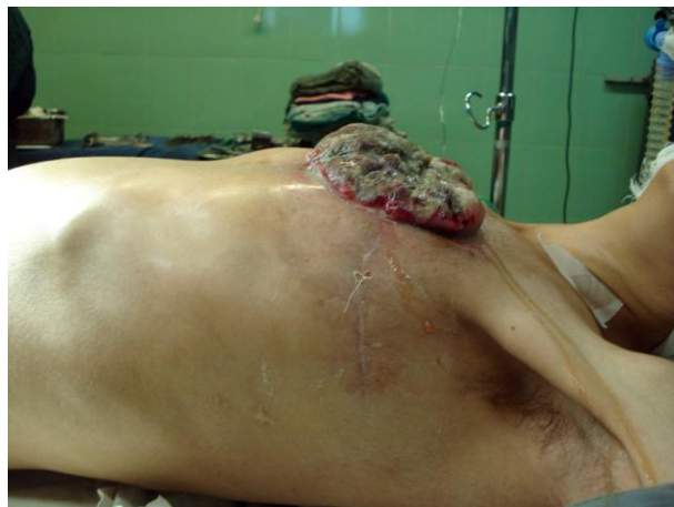
Figure 2. Pre operation ulcer