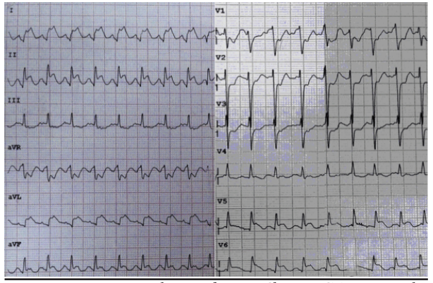
Figure 1: Presentation Eletrocardiogram Showing ST-segment Elevation in the Lateral Leads, without Clear Q waves, and Reciprocal ST-segment Depression in the Antero-septal Leads.

Considering the relative discordance between patient's symptoms and the ECG findings, on top of the patient's general condition, a decision was made not to proceed to primary angioplasty, but to gather further information. Transthoracic echocardiogram showed a mass with a maximal thickness of 21 mm, localized in the antero-lateral and infero-lateral walls (Figs 2 and 3), rendering them akinetic, without other segmental contractility abnormalities, but already originating moderately depressed left ventricular function. Blood analysis identified a normocytic normochromic anemia, leukocytosis with neutrophilia, increased C reactive protein, hyponatremia, and increased D-dimers and troponin I (Table 1). A computed tomography (CT) scan (requested to exclude pulmonary thromboembolism) confirmed the presence of a pericardial mass involving the left ventricle (Fig 4), and showed signs of pulmonary distal pulmonary embolism as well as a bilateral pleural effusion, multiple atelectasis and nodular lesions suggesting neoplastic dissemination and destruction of the costal arches.