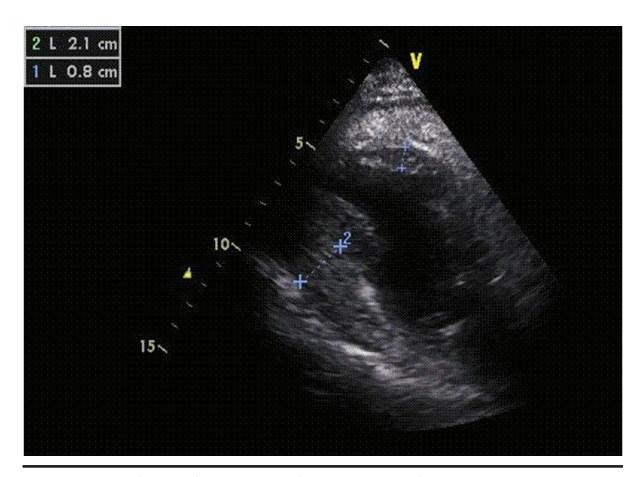
Figure 3: Echocardiogram in the Parasternal Long Axis View. Confirmation of significative hypertrophy of the posterior wall, reaching 21 mm (2).