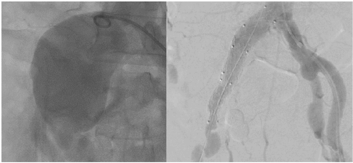
Figure 1. First Angiogram Showing a Large Common Iliac Aneurysm