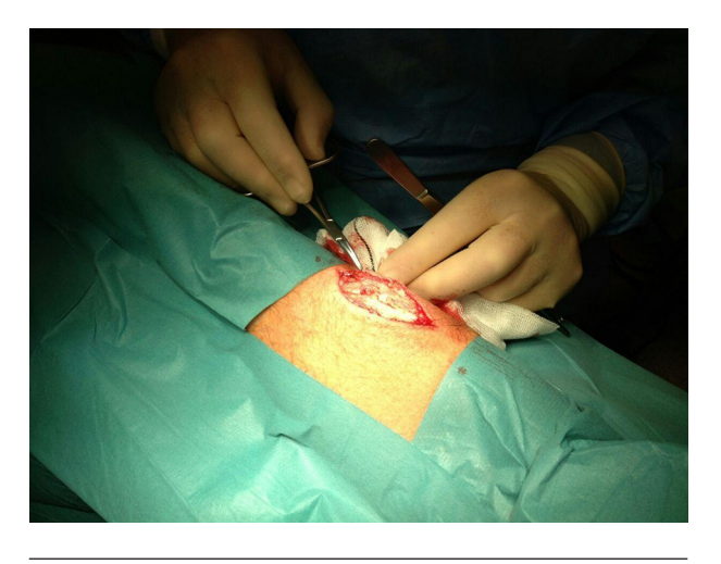
Figure 3. Location of Autotransplant in the Forearm