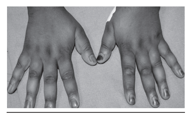
Figure 1. Showing Diffuse Hyperpigmentation Involving Extensor Surfaces of Hands

ides 193 mg/dL, low density lipoprotein levels (LDL) 190.4 mg/dL and high density lipoprotein levels (HDL) 33mg/dL.