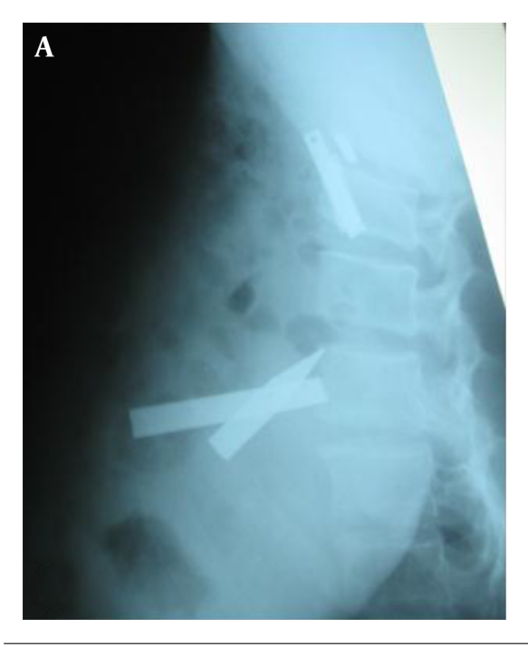
Figure 1. X-ray of the Abdomen Revealing Multiple Metallic Objects