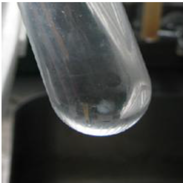
Figure 1. The Pellet of the 146s Antigen of Foot-and-Mouth Disease Virus Serotype A at a Concentration of 50% Sucrose