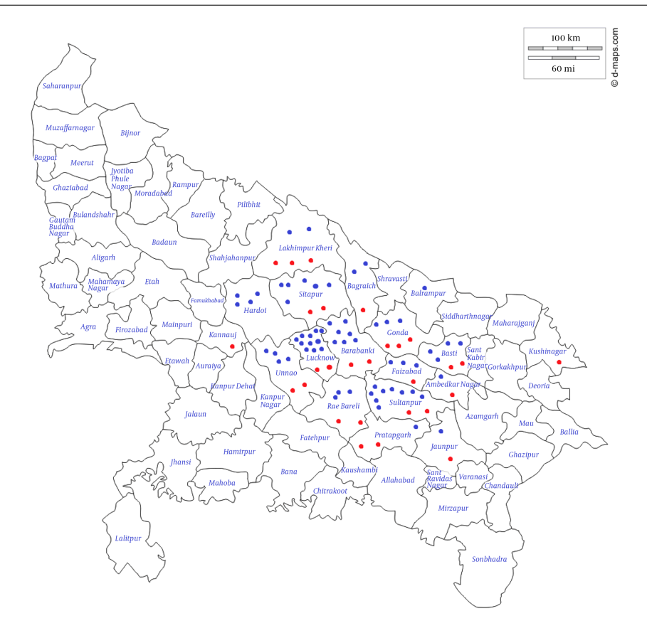
Figure 1. Map of Uttar Pradesh Showing the Districts that the Patients Came From