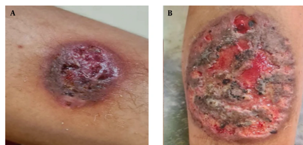
Figure 2. A, leg skin lesion at first; B, the lesion at the time that diagnosis of myelodysplastic syndrome (MDS) was made.

Special histochemical staining and polymerase chain reaction (PCR) tests for Mycobacterium tuberculosis and Leishmania were negative.