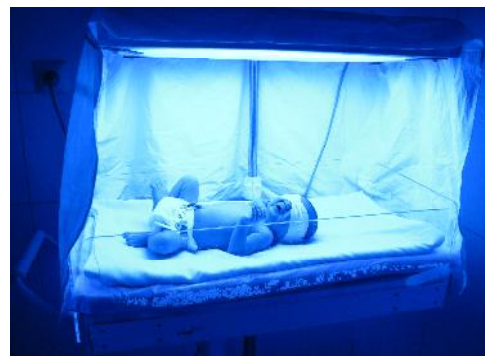
Fig. 1: White plastic cover around the phototherapy unit

All the infants under study, before starting phototherapy had detailed physical examination and necessary tests including determining blood group of mother and infant, peripheral blood smear, reticulocyte count, direct and indirect