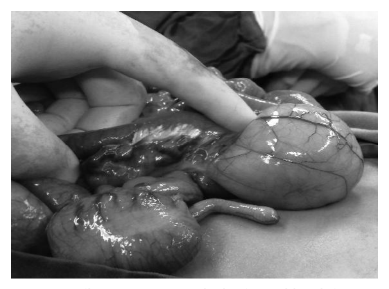
Fig. 3: Gross view of lipoma at antimesenteric border of terminal ileum, before resection

mesenteric nodal masses and may be found in patients with celiac sprue<sup>[7]</sup>.