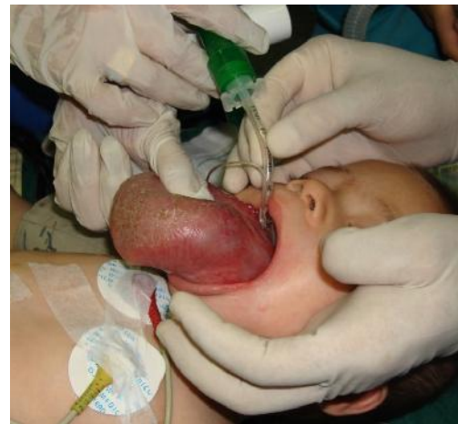
Fig. 2: Intubation eased by pulling the tongue out