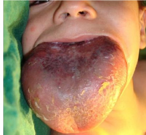
Fig. 1: Hemangioma of tongue with difficulty in feeding and speech

During surgery 130 cc packed cells was transfused. He was transferred to PICU where extubation was performed 48 hrs later without airway or respiratory difficulties. He was discharged from hospital 1 week later. Pathological diagnosis was cavernous hemangioma with focal thrombosis. One and half years later he was able to close the mouth, eat, and speak properly.