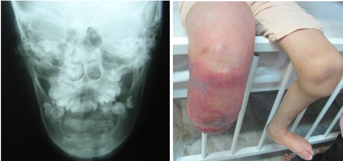
Fig. 3: Mandibular lysis, dental deformity and post amputation cellulitis, recurrent infection in a 13 year old girl with CIPA syndrome

an amputation was performed. Three weeks after the amputation, however, she came back with massive cellulitis in the site of surgery which progressed to the knee but she didn't feel any pain. Our case had also significant mandibular lysis and dental lisions. She was mentally retarded. Osteolysis on her fingertips was seen, but there was no sign of ocular disturbance (Fig. 3).