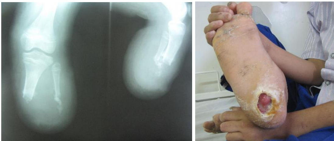
Fig. 1: Finger tip osteolysis (right) and painless heel sore (left) in a 12 year old boy with CIPA syndrome

Case 2: A 13 year old girl was referred to our department because of purulent discharge from a deep sore in the talus and calcaneus of her right foot with history of recurrent osteomyelitis from the first months of life. She suffered from the absence of normal reaction to painful stimuli or heat. She occasionally had hyperthermia, and convulsions, high fever with abnormal electroencephalogram (EEG) and received anticonvulsant drugs. There was no family history of special or hereditary diseases. She was the second child of related (first cousins) parents. EMG-NCV, and immune tests were normal, and viral markers negative. The patient had first experienced osteomyelitis when she was 3 years old in her buttocks and lumbar sites. Her last hospitalization was because of a resistant infection which did not respond to different antibiotics during the 3 preceding months. Because of a harmful deformity in her heel and ineffective antibiotics, after an orthopedic consult,