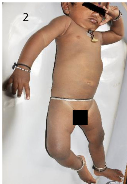
Fig. 2: Photograph of the 9 months old first cousin of the baby (Fig 1) shows fading extensive Mongolian spots