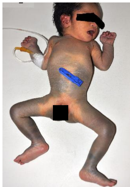
Fig. 1: Photograph of the child shows extensive Mongolian spots involving the trunk and extremities

had developmental delay or history suggestive of metabolic disorders. Thus in view of characteristic family Pedigree presentation (Fig 3) of the bluish discoloration of the skin, which fades away in the later life, it was diagnosed to be extensive Mongolian spots of an autosomal dominant inheritance.