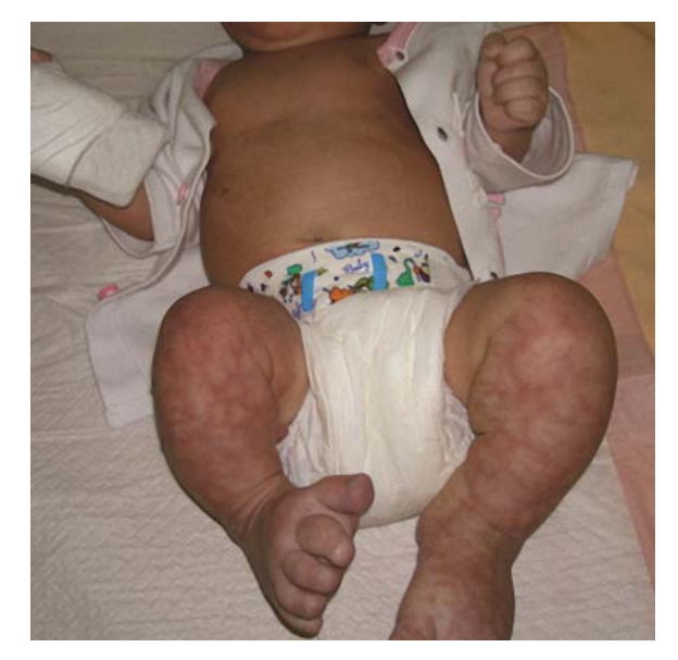
Fig 1: Extensive port-wine staining of the lower extremities; note the widend interphalyngeal cleft especially in the right foot

Klippel-Trenaunay syndrome is characterized by a triad of port-wine stain, varicose veins, and