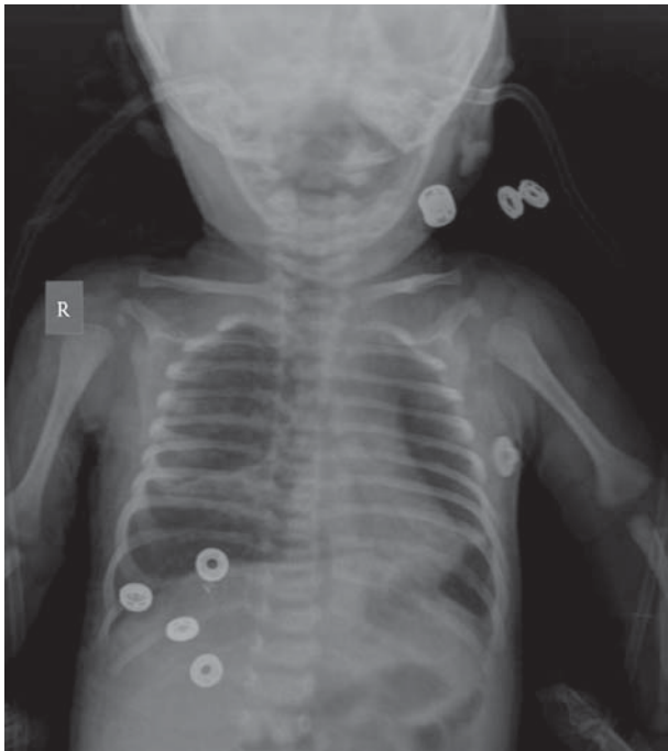
Figure 2. The Patient's Chest Roentgenogram Demonstrated Bilateral Pulmonary Infiltrations and Atelectasis