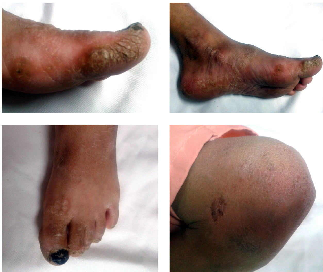
Figure 1. Palmoplantar Distribution of the Skin Lesions

A holosystolic murmur was heard at the apex radiating to the axillary region, and a gallop rhythm was detected. She had no organomegaly except for palpating the liver about 3 to 4 centimeters below the rib edge. No clubbing or more important findings were found. The chest X-ray showed cardiomegaly (Figure 2). On echocardiography, the left ventricle was dilated and had a non-compaction pattern with its ratio to the compacted compartment more than 1.4/1. The M-mode displayed a decreased ejection fraction and an increased E point septal separation (EPSS).