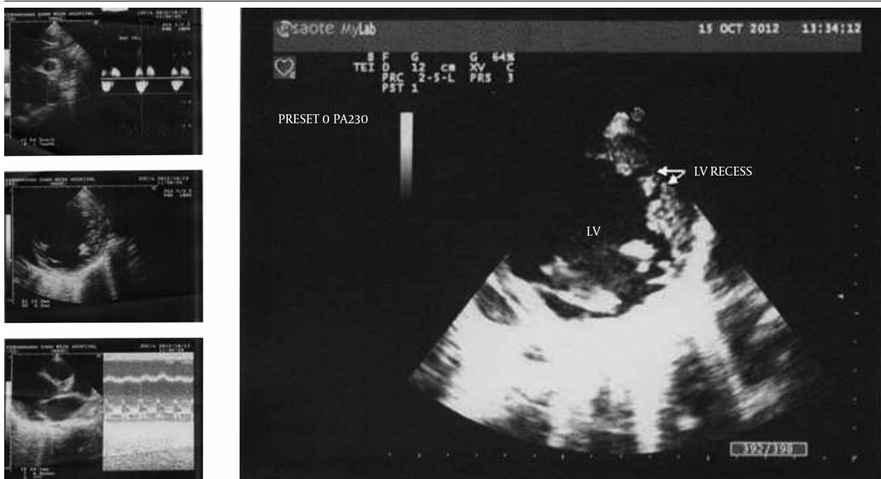
Figure 3. M Mode Echocardiography Showing LV Ejection Fraction and Increased EPSS (Left) and Short Axis View Demonstrating LV Recess in Favor of LVNC

LVNC, a cardiomyopathy of unknown cause results in elements of both left ventricular dilatation and restriction. The condition may be diagnosed at any age, from infancy to young adulthood, and the severity of heart failure varies. The echocardiogram is diagnostic and shows a specific pattern of left ventricular hypertrophy with deep muscular crypts. Patients may be at risk for ventricular arrhythmias and sudden death, as well as mural thromboses and stroke. Although some patients may