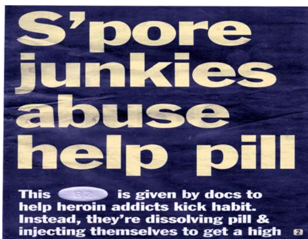
Figure 2. Singaporean newspapers against buprenorphine

market. This is an indication of a fairly large-scale diversion and abuse, in part due to the medical profession not being adequately familiar with the treatment of chronic opiate dependent patients, especially those with long histories of multiple incarcerations, antisocial behaviors and personality disorders. The study also showed that 53.3% of subjects only started intravenous drug use, after the introduction of buprenorphine. Since it is well documented that the injection of medications designed for oral consumption puts the abuser at a risk of harm from the rapid onset of drug effect, local injury and vascular injury, these findings are of concern, as buprenorphine is prescribed only for sublingual use (Figure 2).