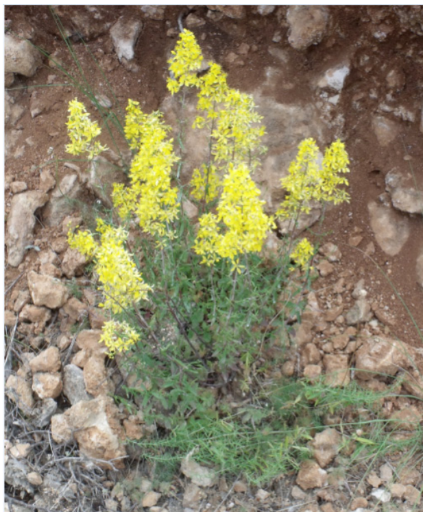
Figure 1. A view from H. lydiium plant at flowering in its native habitat.

infusion (6). Besides, H. lydiium is a well known wound healer and its decoction is also used as tea internally in treatment of hemorrhoids (7, 8). Results from recent studies reporting the antimycobacterial (9) and antioxidant (10) properties of H. lydiium sign out the great potential of this species as a promising medicinal plant.