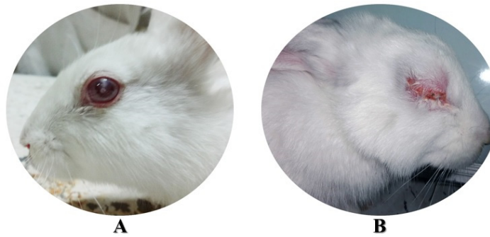
Figure 1. Dense opacity (A) blepharospasm and ocular discharge (B) 12 and 48 h after bacterial inoculation, respectively.

At the end of 108 and 204 h, corneal opacity in the C+N+B group was better than others that it was significantly less than that observed in groups CO +, CO -, N and N+B (Mann-Whitney U-test, P < 0.05 ) (Table 2 and Table 3, Figure 2).