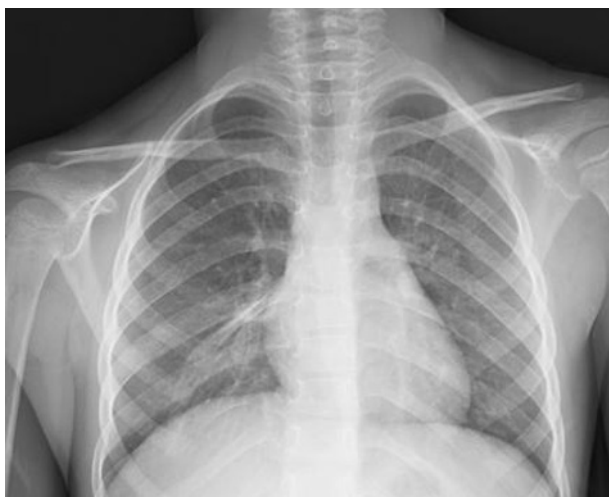
Figure 1. Chest X-ray; right perihilar hyperlucent appearance

There are various types of congenital anomalies of the ribs, including developmental fusion. These anomalies occur in 0.15%-0.31% of the population (5) and the rarest one is an intrathoracic rib. Approximately forty cases have been reported so far until first described in 1947 (6). The development of this anomaly may be explained by both certain alterations in gene expressions and incomplete fusion of the sclerotome, from which the rib originates normally (1,2). They are more commonly asymptomatic, unilateral and on the right side with no gender predilection (2). Approximately one-third of the reported cases are in children. It is usually found incidentally in both the pediatric and adult population and causes misdiagnosis in the majority. The case was also on the right side and was detected incidentally. It did not result in any complaint at all. The first classification of intrathoracic ribs represented in 2006 (7). Type I-a is an intrathoracic rib originating from a vertebral body and type I-b is an intrathoracic rib originating from a rib.