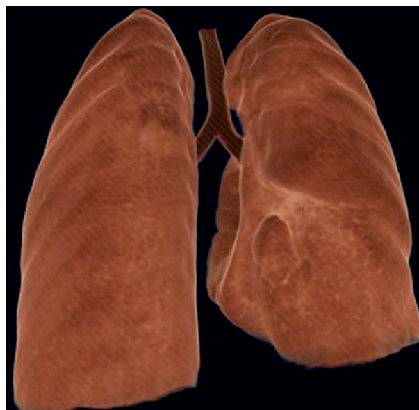
Figure 3. Collapse of the lower lung parenchyma on the right side

A right intrathoracic rib which is articulated on the anterior aspect of the T7 vertebral body and protrudes into the thorax cavity causing collapse of the lower lung parenchyma