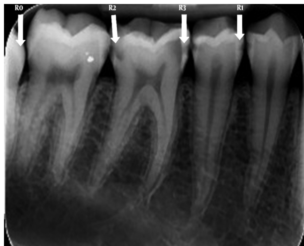
Figure 2. Classification of caries according to the depth of caries in radiography. Sound (R0), restricted to the enamel (R1), reaching the dentino-enamel junction, reaching the outer half of the dentin (R2) and the inner half of the dentin (R3)

Moreover, CCD Dixi3 was applied in the present study with a spatial resolution rate more than Dixi2 (16 lp/mm);