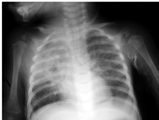
Fig. 2. An 18-month-old child with pulmonary TB. Note consolidation in RUL with air-bronchogram and interstitial lung marking more prominent in the left side.

Eight patients (26.7%) presented with manifestations of musculoskeletal, gastrointestinal, genitourinary and central nervous system involvement instead of pulmonary symptoms (Table 1). Some radiographic patterns are depicted (Figs. 1-4).