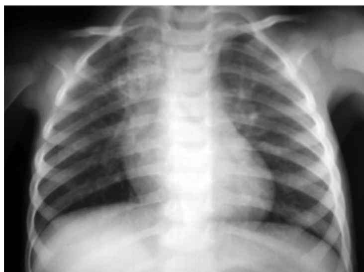
Fig. 3. A 2-year-old child with proved TB. Note calcified right paratracheal and left hilar lymphadenopathies.

Most pulmonary tuberculosis cases seen in infants are due to primary infection. It begins when the respiratory secretion of a patient with TB is inhaled and reaches the lung alveoli which then causes parenchymal inflammation. 2,13,16 The primary focus is the initial inflammation which is produced by localized alveolar consolidation. 2 This primary focus of TB is usually not visible on CXR but may rarely progress to involve a segment or an entire lobe. 16,17 Infection then spreads to the central lymph nodes from the primary focus via draining lymphatic vessels, (appearing as a linear interstitial pattern on chest radiographs) and