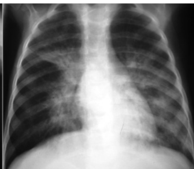
Fig. 4. A 4-year-old child with pulmonary TB. Bronchopneumonic infiltration in both lung fields and right hilar lymphadenopathy are noted.