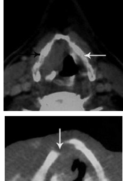
Fig 2. A 57-year-old man with cough. Laryngeal cartilage neoplastic invasion revealed chondrolysis (white arrow).

Fig. 1. A 62-year-old woman with hoarseness. Laryngeal cartilage neoplastic invasion revealed increased density (white arrow).