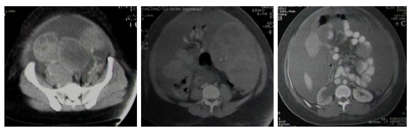
Fig. 1. Spiral abdominopelvic CT with oral and intravenous contrast reveals ascites, bilateral pelvic masses, intraperitoneal masses, encasement of the right ureter by tumor and right-sided hydronephrosis.

Burkitt's lymphoma occurs most commonly in